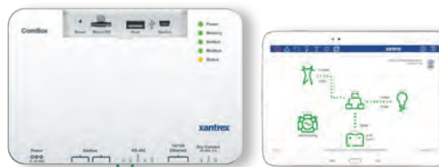
FREEDOM SW Conext Combox (809-0918)

Available telephone to network cable adapter to avoid the need to replace cables when replacing and old inverter. (#808-9010 sold separately)