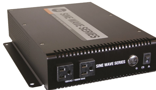
115 VAC Output Model Shown

1500 Watt DC to AC Pure Sine Wave Inverter for 115 or 230 Volt AC Applications